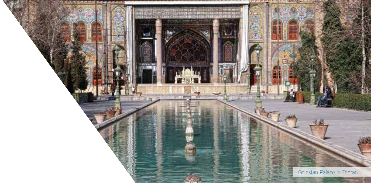
Golestan Palace in Tehran

Transfer back to the hotel Spend the night in Tehran